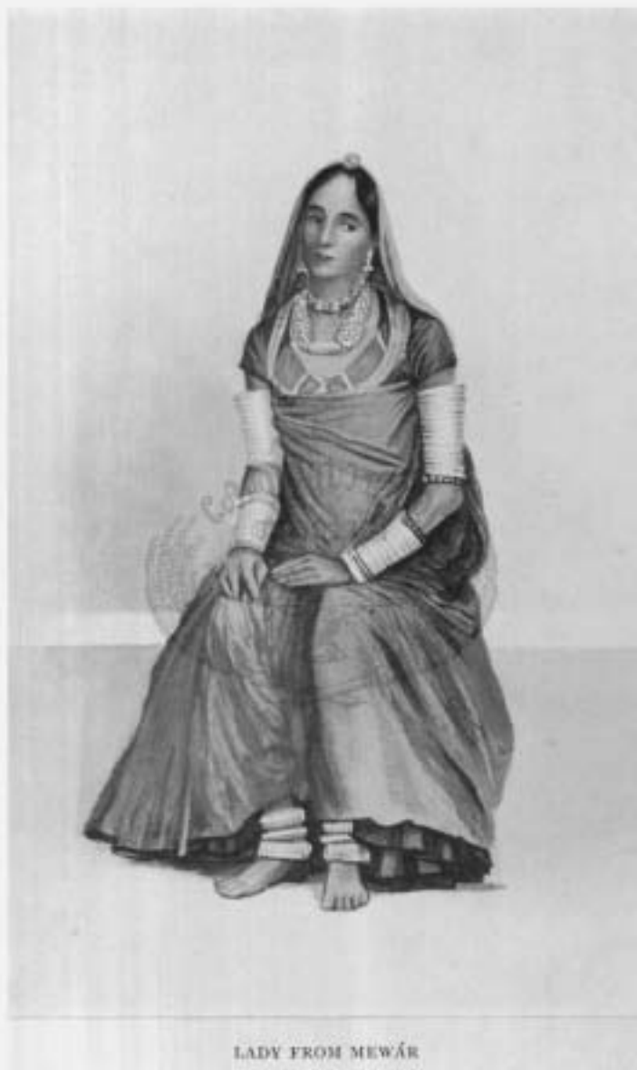
LADY FROM MEWÁR